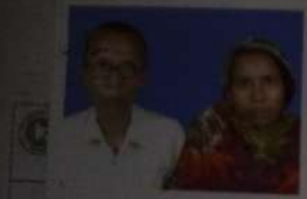
ST Banglaces of State of Control