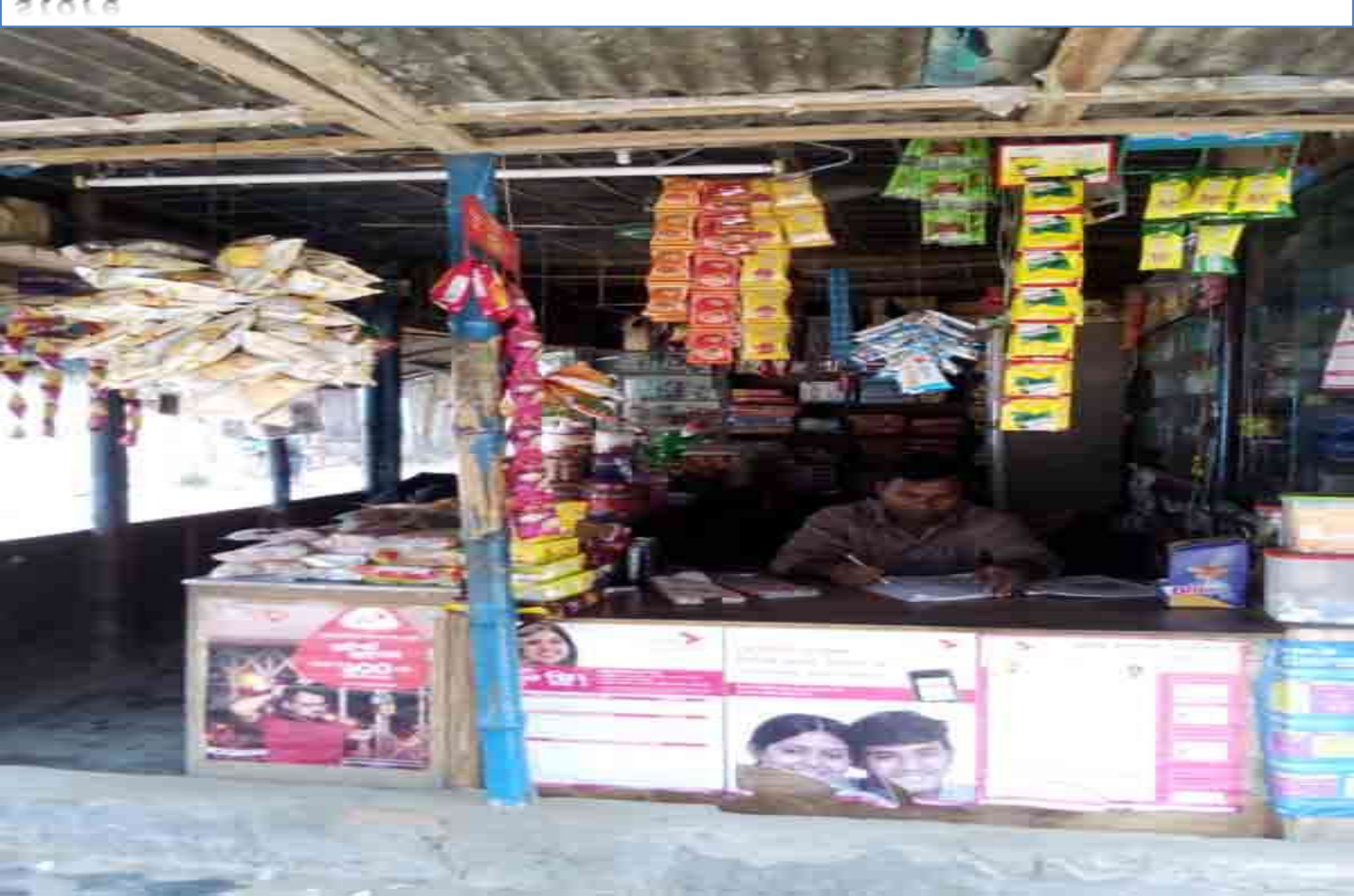
Proposed NU Business Name: Bhai Bhai Telecom & Varieties store